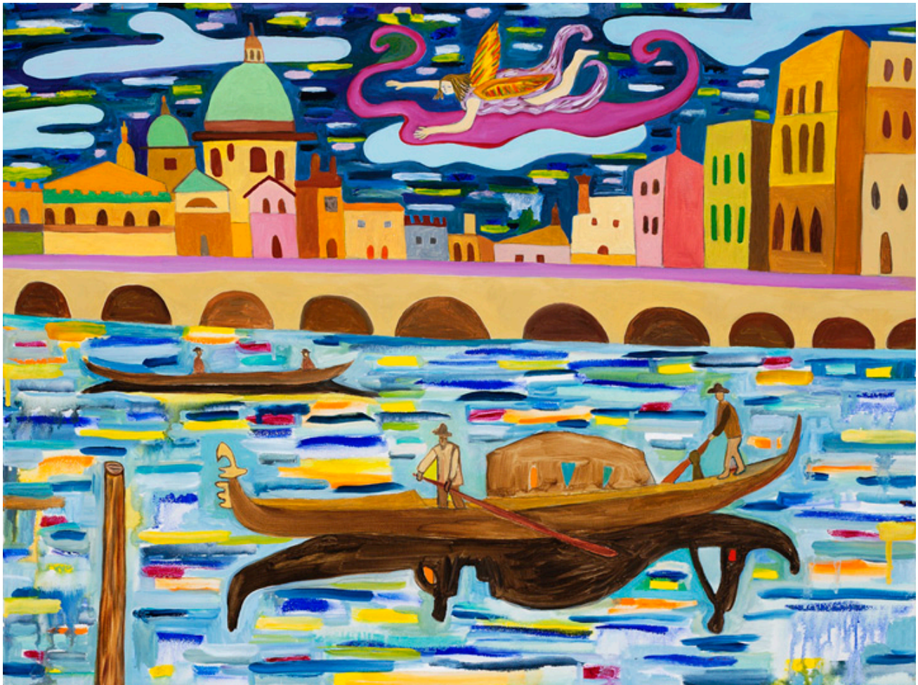
SUSAN BEE DEATH IN VENICE OIL ON LINEN 18 X 24 INCHES 2011