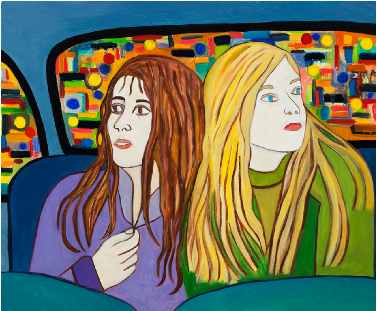
SUSAN BEE TROUBLE AHEAD OIL ON CANVAS 20 X 24 INCHES 2012