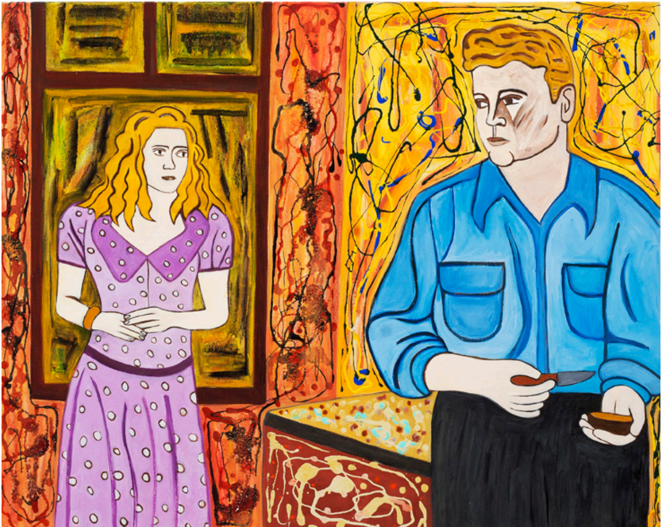
SUSAN BEE CRISS CROSS OIL, ENAMEL, AND SAND ON CANVAS 24 X 30 INCHES 2012