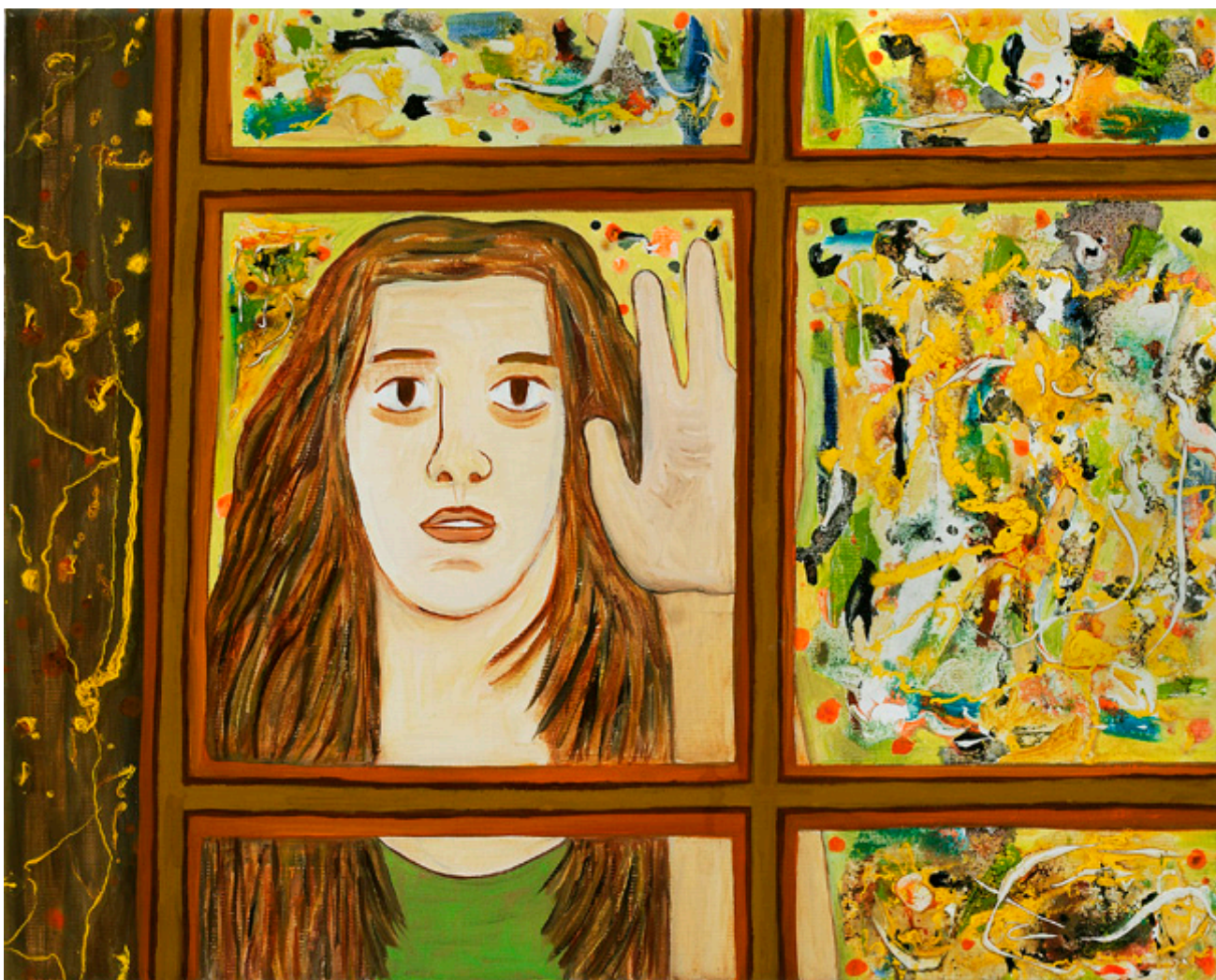
SUSAN BEE OUT THE WINDOW OIL AND ENAMEL ON LINEN 16 X 20 INCHES 2011