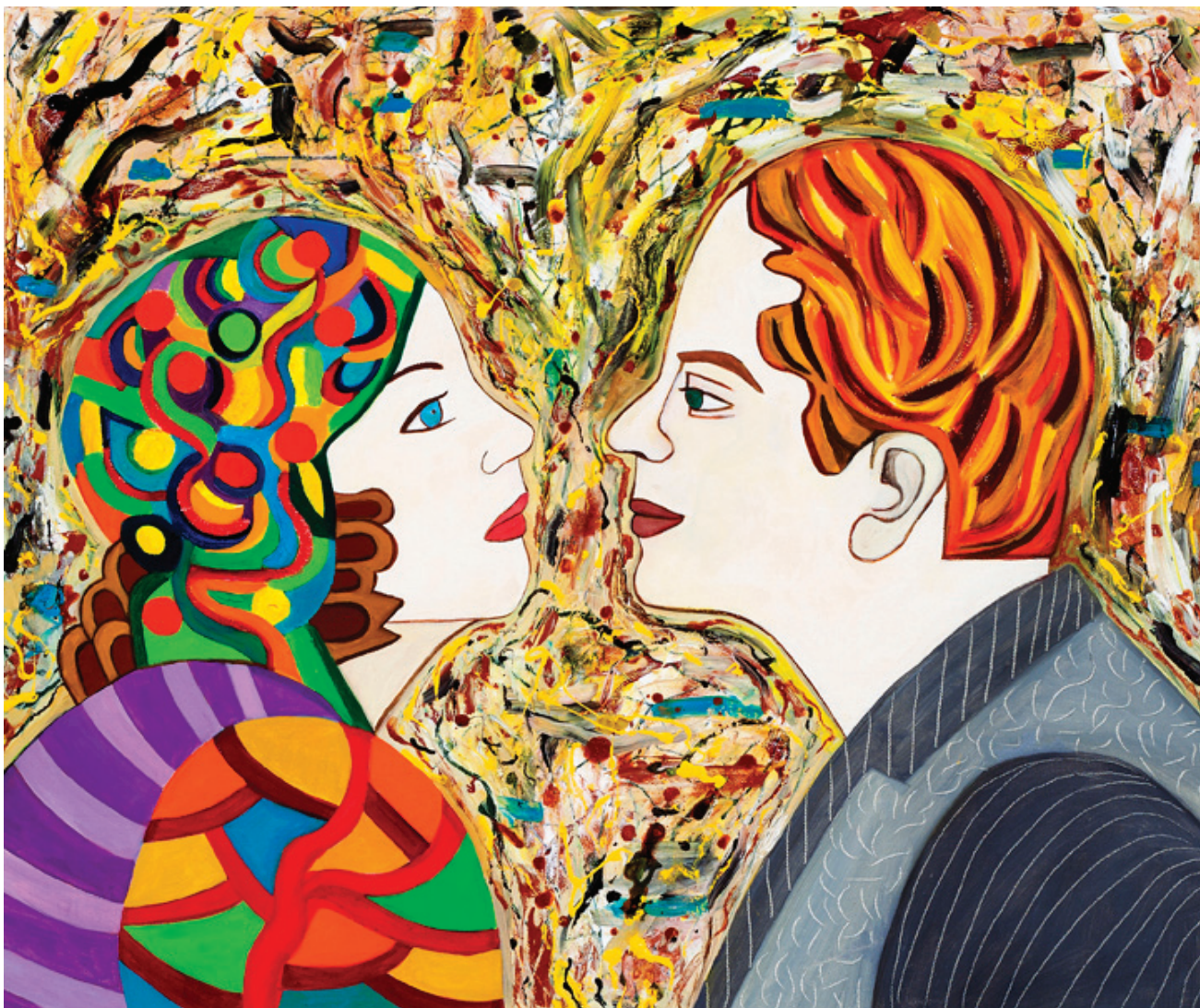
SUSAN BEE FACE TO FACE OIL AND ENAMEL ON CANVAS 20 X 24 INCHES 2013