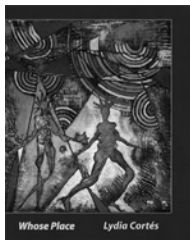
Whose Place Lydia Cortés