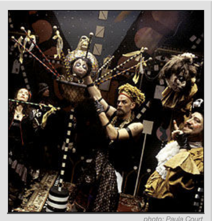
Panic! (How to Be Happy!): as the brain turns

Shanghai Moon, Busch's latest entry on the list of past genres to subvert, deals with that eternal collision, so dear to the hearts of Art Deco collectors, between the ancient, corrupting East